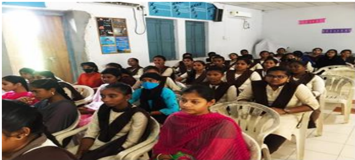
Distributed Voters application