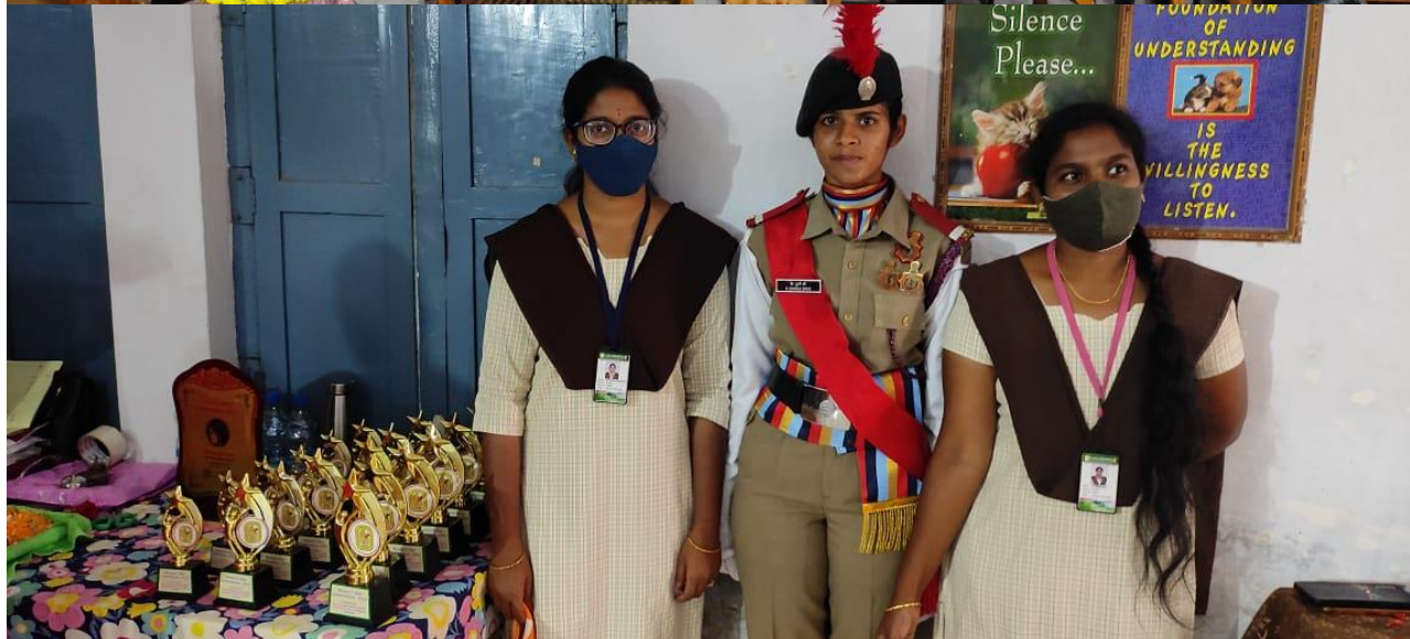
women's Day Celebrations_