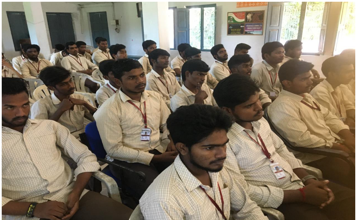
National Democracy Day