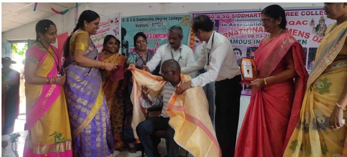
women's Day Celebrations