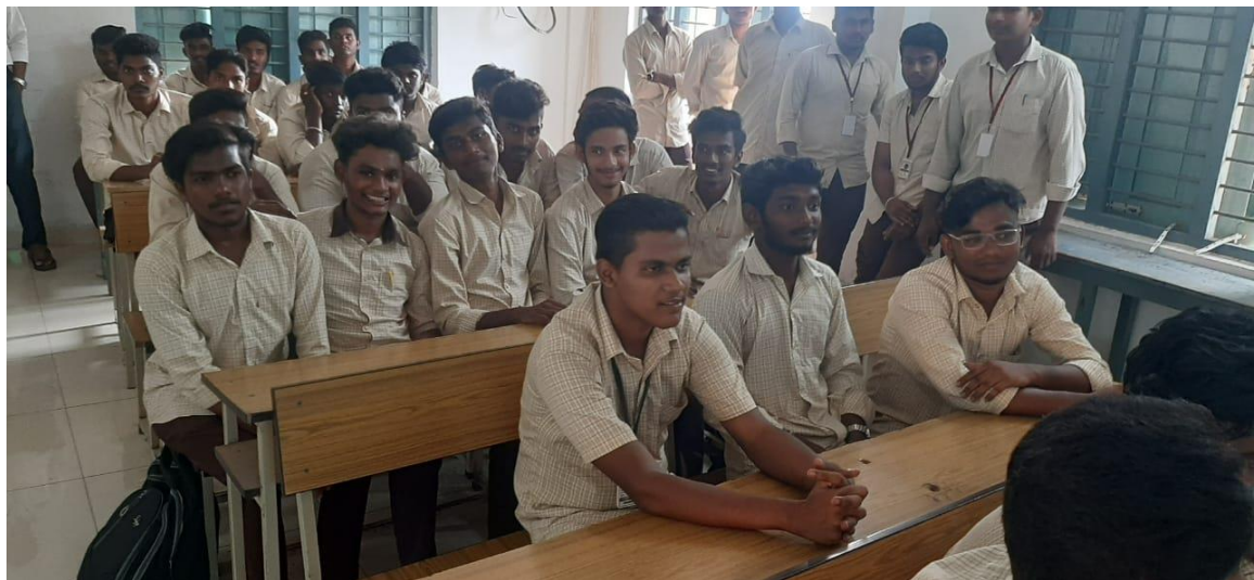
National Democracy Day